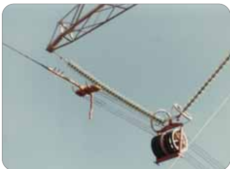
HEAD BOARD CROSSING A CAE 637