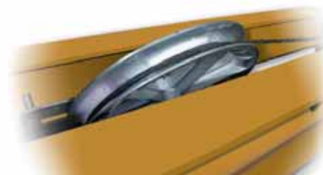
ALL ALUMINIUM PULLEY